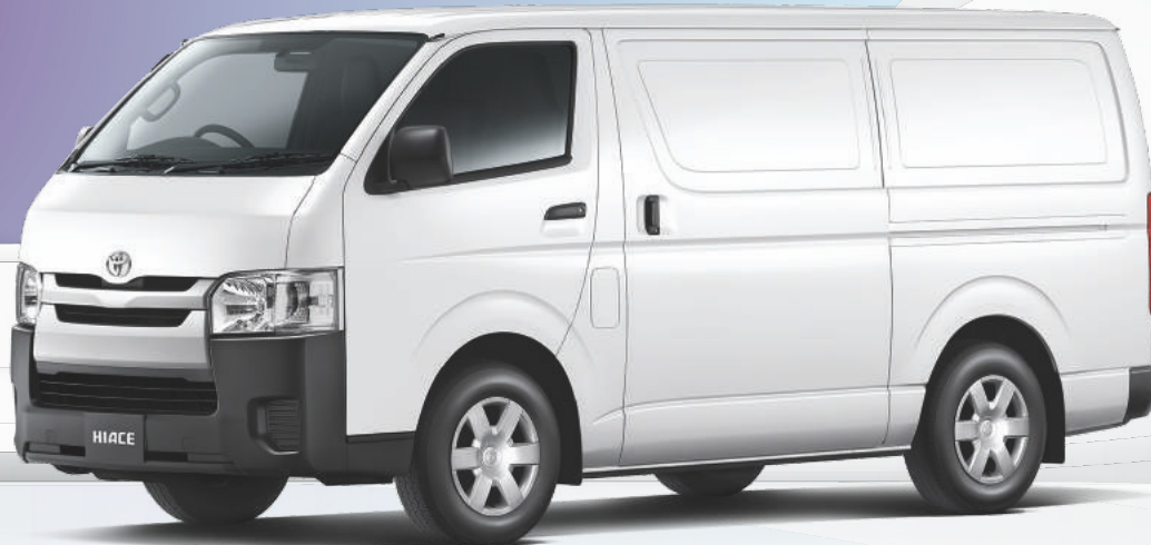
Image shown is Hiace Panel Van 3.0 Turbo Diesel.

MORE POSSIBILITIES. ENDLESS OPPORTUNITIES.